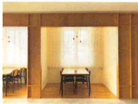
► DEN ROOM

5F < guest room > Twin room (1~3 persons) Superior room (1~4 persons)