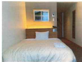
► Moderate room (18㎡)