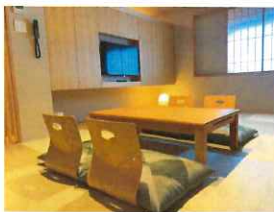
► Superior room (56㎡)

The interior of the entire facility are non-smoking .