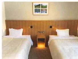
► Twin room (26㎡)